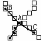
Figure 6. Three branches distinguishing

□ If there are three 8-neighborhood points, it shows that this point has three branches. See figure 4(d).