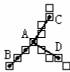
Figure 5. Main root and child root distinguishing in two branches

It is obvious that there are two branches in this point. Then this point has a child root. See figure 4 (c).