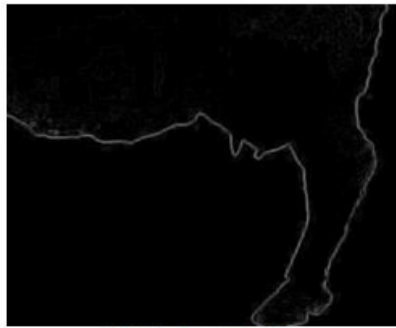
(b) Median Filtering