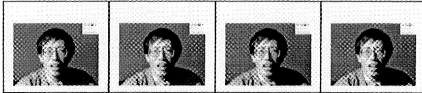
Figure 2. a continuous deformation sequence of a real example

So, (\Delta_x^{\min}, \Delta_y^{\min}) affects the recognition precision.