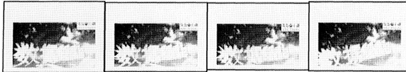
Figure 3. a continuous deformation with topological structure

Figure 3 shows a 3DSMAX move, which is by our programming, a continuous deformation with topological structure non-holding with precision ((\Delta_x^{\max}, \Delta_y^{\max}), (\Delta_x^{\min}, \Delta_y^{\min}), \Delta_t) = ((12, 12), (2, 2), 1) , occurring a topology break.