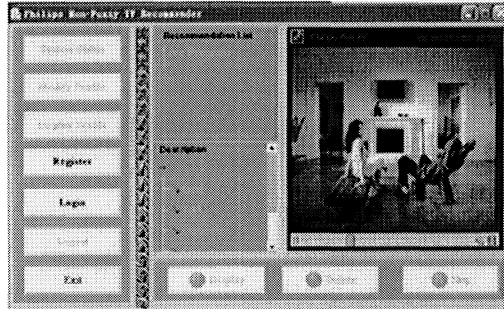
Figure 1. Main Interface