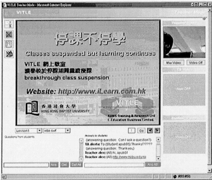
Figure 1. A Teacher's View inside the VITL Virtual Classroom