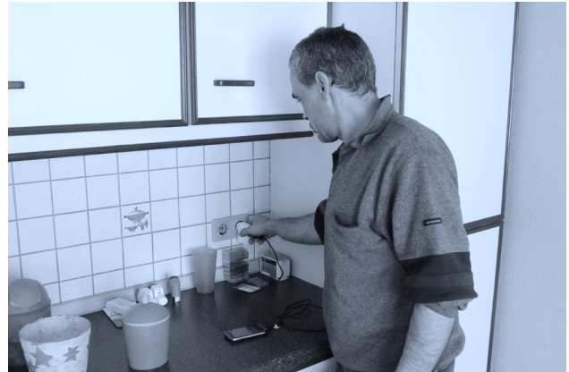
Figure 1: Oftentimes, flexible switches were chosen. Where different appliances are to be plugged in, the infrastructures flexibility becomes a key issue for data integrity.

A second common phenomenon was the participants desire to reconstruct usage scenarios of the past. When talking about HEMS and its visualizations, sometimes the user found points of particular interest. Most times these were motivated by the user remembering a specific usage situation with unknown consumption, or triggered by the feedback mechanism, where the amount of consumption raised curiosity concerning the root of the consumption (Fig.2). Both cases show, how participants tried to combine context and feedback data to receive information that enabled them to apply individual energy practices. We therefore think that opportunities to effectively transport context, such as reference systems, can contribute to