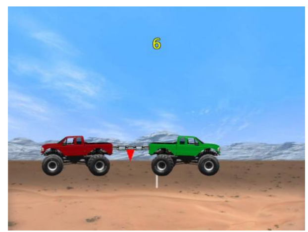
Figure 1. The Truck Pull game. Player 1 (red) has taken the lead with 6 seconds remaining.

Truck Pull: In Truck Pull , two players engage in a virtual tug-of-war by pedaling on their respective stationary bikes. Each player is represented by an on-screen truck. Both players' trucks are connected by a big chain (see figure 1). The trucks move in the direction of the player who is pedaling with the higher cadence. After one minute, the player who has moved the trucks closer to her side of the screen is the winner.