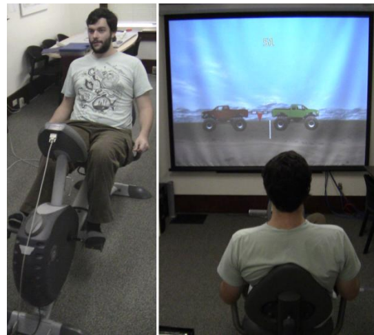
Figure 4. Equipment setup. Left: player pedaling on bike; Right: player's view of the game.

The study was designed to investigate the effectiveness of haptic feedback in exergames, not the long-term exercise efficacy of the games. Therefore, each trial was short, lasting between 1 and 5 minutes. Participants were given time between each trial to cool down and return to a resting state. Following the completion of all six trials, the two participants were brought back into one room for a post-experiment interview and debriefing.