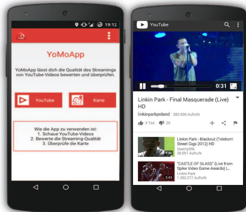
Fig. 1. Screenshot of the YoMoApp.

The remainder of this paper is structured as follows. First, we briefly introduce the YoMoApp in the Section II. After-