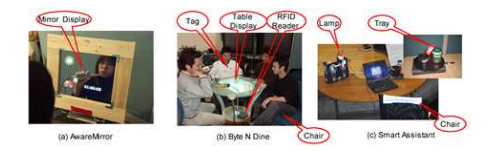
Fig. 2. Sample Applications Developed using Prottoy

This component is dynamically generated when the application is deployed and runs at application space. This component is non-editable and is primarily created targeting the end users of the application developed using Prottoy. So we can consider it as a macro running on top of Prottoy. The preference manager provides endusers with the facility to enable or disable the participation of any artefact in the application.