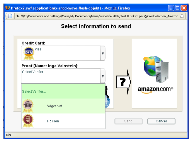
Fig. 3. One example of the attribute-based approach.

The second design concept was based on what we called the attribute-based approach (Figure 3), in which test participants were told that "attributes" of information were imported from different certifying authorities. Participants could select the authorities that certified certain attributes, and thereby choosing the attributes they would like to reveal to the service provider. After they had selected the attributes they were asked to confirm their decision at a second step, before the information was sent.