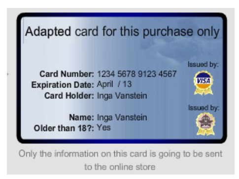
Fig. 6. Example of the adapted card containing the selected information.

When participants were done selecting the credentials they press the "Send" button located in the bottom right corner and they were asked question "What information do you believe you have sent to Amazon.com?" (and the subheading "Write what pieces of personal information you think will be sent to Amazon.com when you pressed the 'Send' button").