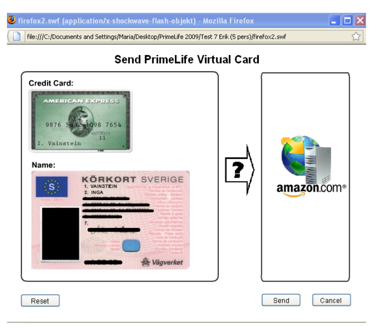
Fig. 2. Card-based approach blacking out non-disclosed attributes.

credentials. In the initial iterations, the property of data minimization was illustrated with an animation that "cut out" selected attributes from the card and transitioned them into a newly created virtual card , which was to be revealed to a service provider (Figure 1). The idea was to make users visually aware of the pieces of information that were being cut out and moved into the new virtual card, making it clearer that only the information on the virtual card was being sent to the service provider. In later iterations the attributes of the card which were not to be disclosed to the service provider were blacked out, leaving only the card attributes to be sent visible to the user (Figure 2).