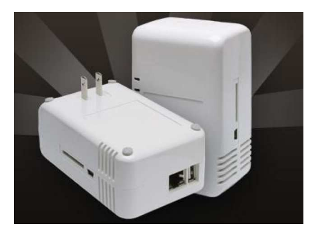
Figure 1. SheevaPlug plug computer.

and laptops, plug computers have the potential to be used in nefarious ways, all the while maintaining a low profile because of their small size.