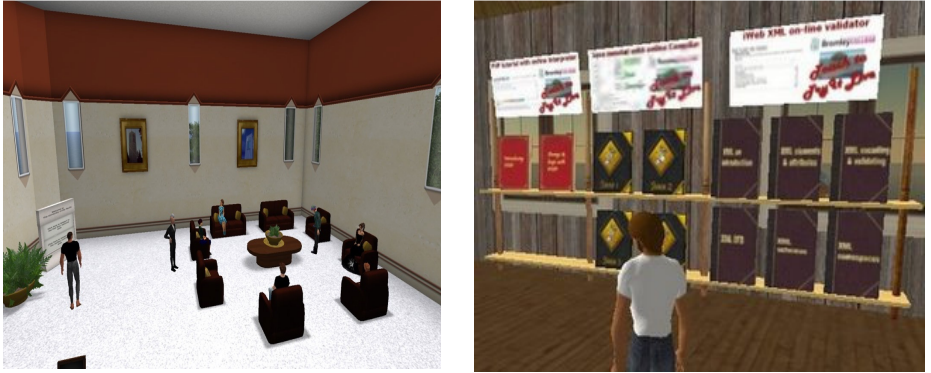
Figure 6: (a) Room without a normal exit; (b) Metaphors for conveying the function

Form should follow function : This principle implies that aesthetic considerations in design should be secondary to functional considerations. The participants mentioned that the design should reflect the learning activities: "... the design should be functionally and pedagogically appropriate, [and] integrated'... a design for a purpose". One educator gave a specific example: "... I actually used objects that looked like books, so the student would go up to a book and the book would open for them ..., so I tried to keep that form and function consistent with real-life and that sort of worked quite well" [SL educator] (see Figure 6(b)).