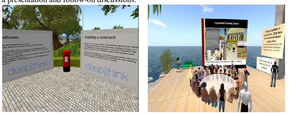
Figure 1. (a) A drop box to collect feedback; (b) A round-table discussion

An educator discussed how the intended function should be integrated within the design: "I say one thing it needs to be very clear what the aim of the space is, ... that should not be because there is a nice sign saying what it is for but it should be in the character of the development. Something in the look and feel, the way you interact with the space is representative of its use so that it will make it easy for the user to understand" [Deep Think]. The objects in the learning spaces should imply the way in which the spaces can be used: "Well, I already mentioned chairs, although totally unnecessary [for the avatars] they do signal that a meeting is going on and certain people have committed to participating for a while" [SL educator and designer]. In Figure 1(b), chairs, a table, slide presenter, posters on the walls have been used to aid a presentation and follow-on discussions.