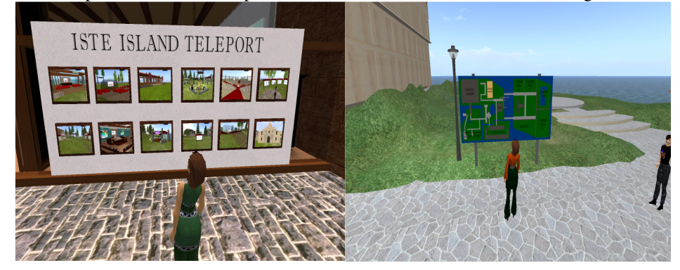
Figure 4: (a) A teleport map; (b) map showing the various places on the island

teleport maps or even maps (see Figure 4) help in orientation and provide robust mental representations of the space and aid the user in route decision-making.