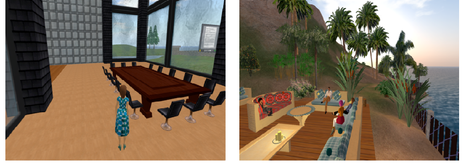
Figure 2. (a) A meeting room; (b) An open-air meeting venue

Consider ambience and aesthetics of the learning space: Ambience and visual aesthetics are important design criteria. Aesthetic designs are perceived as easier to use and promote creative thinking and problem solving (see Figure 2(b)): " If they feel relaxed here -, from visually stimulation, or aural (sound of water flowing)...then maybe they engage more with the tutorial and say more than they would in real-life in lecture hall or for something comparable with MSc usage - they are distance learners and we use discussion boards, skype, wikis, blogs, email..." [SL educator]