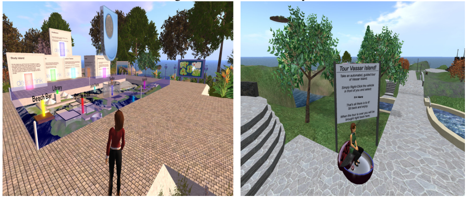
Figure 3. (a) An entry point in Deep Think; (b) Tour in Vassar island

Taking the example of webpage 'stickiness' i.e. the attribute of a site to keep users there and clicking more web pages, SL 'location stickiness' can be enhanced through a well-designed and appropriate arrival point. As one designer commented: "An island has elements of real spaces but also has elements of web-pages. People can be channeled to arrive at a specific point (like with an home page) and this orientation space can be used to provide initial information, engage the user and to show them paths further into the function/space. People are impatient just as they are with web pages. Make them walk everywhere and they won't bother looking. Give them a way to click something and be immediately transported to another part of the space, and they are much more likely to explore deeper." [SL designer]. In Figure 3(b), a tour facility at the arrival point takes the user through the various places on the island to orient and inform the user through a textual commentary.