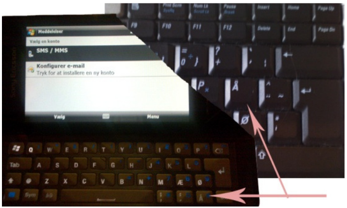
Figure 4. Discrepancy between smart phone and PC QWERTY keyboards

When it comes to the use of smart phones, they often include either a stylus or virtual keyboard in qwerty-style for entering letters, or even in the most modern versions a physical keyboard. In the Xperia version it is however interesting to see how the placement of å is different from the typical Danish qwerty keyboard style (figure 4). For users who are used to writing without looking at keys at a regular qwerty-keyboard, this results in poor speed and disruption of flow in writing (which is especially interesting when investigating interaction with phones for writing mails for work).