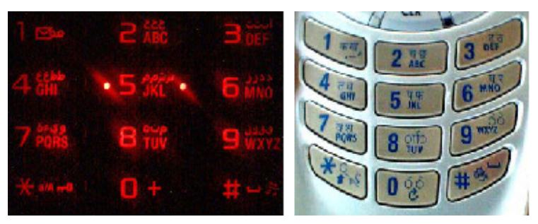
Figure 2. Arabic and Devanagari keypad layouts

These heuristics were applied for Danish, Hindi and Arabic mobile phones, whereas ee have referred the existing research on Chinese.