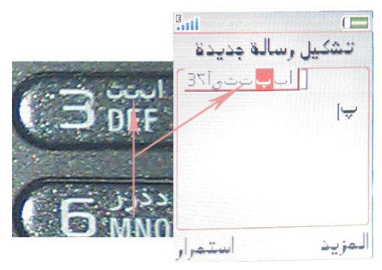
Figure 3. Discrepancy between illustrated and actual number of key press

In general, ligatures and diacritical marks are found by pushing the corresponding letter (often several times), but where the most often used, like [lam-alef] would be part of computer keyboards, it is here found by writing these two letters after each other, and then the combination is automatically made. However, as the keypads do not show this, this has to be experimentally found (on trial-error basis). There are of course, as is also the case in Danish and English, many other special characters to choose from, with needs as much as 9 clicks before they appear on screen. Though they are rarely used, and for the most users perhaps newer used, the "interesting" part is to find them, as they are not illustrated on the pads, and they are not always placed at the same place in the phones, similar to Hindi and Devanagari writing discussed earlier.