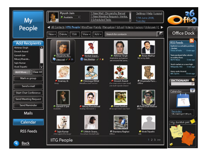
Fig. 4. A screen shot of the final GUI.