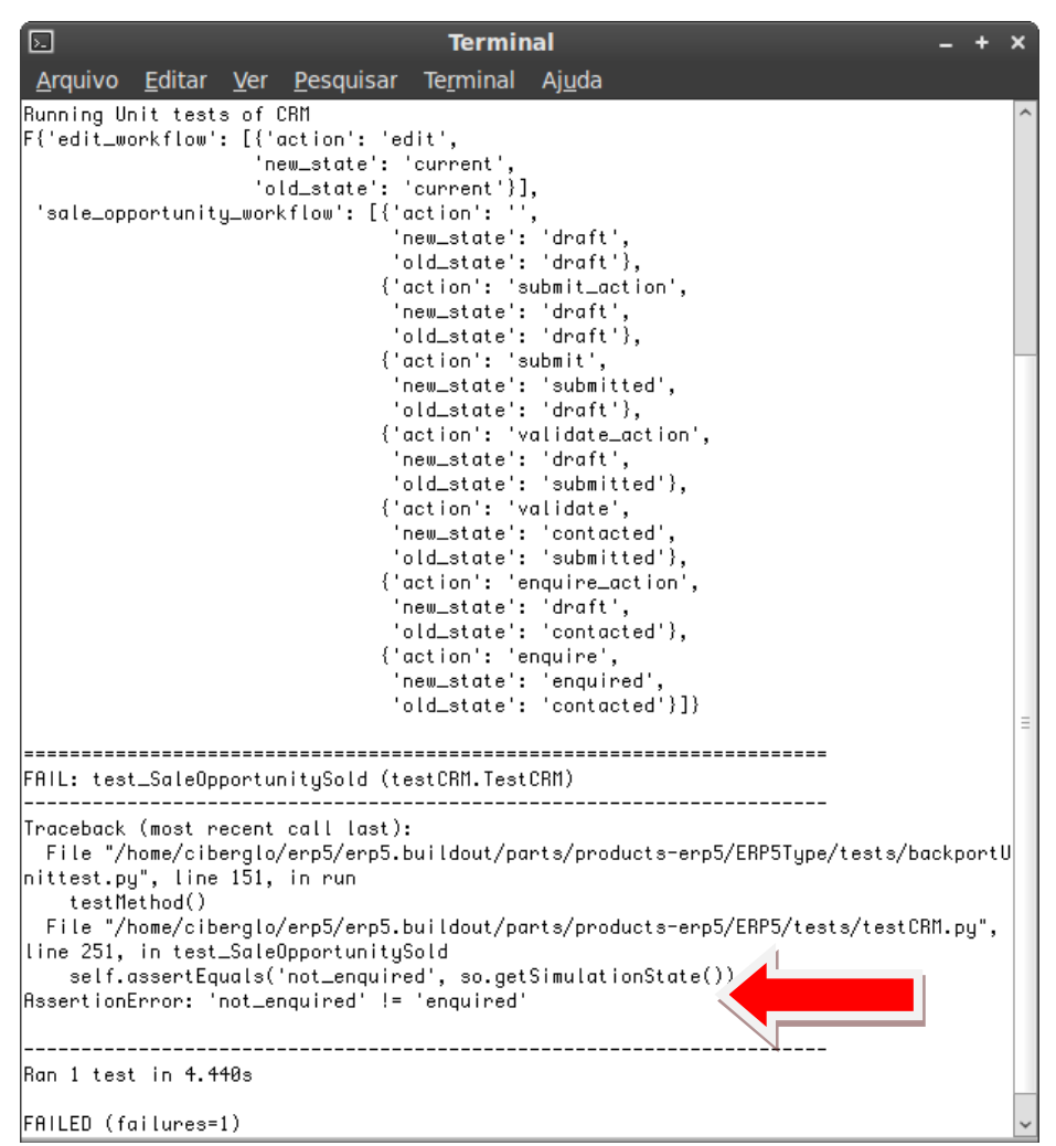
Fig. 5 Test failed while trying to transit to a wrong state.