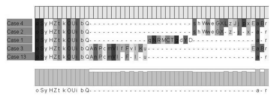
Fig. 1. Trace alignment.

The technique presented in section 3 has been implemented and the traces of module Management of Roles from National Identification System (SUIN) were analyzed. The SUIN is a system developed by the Cuban Ministry of Interior in conjunction with the Cuban University of Informatics Sciences. The event log did allow determining anomalies in the selected process (31 cases, 804 events, 52 events classes and 3 types of events). The first step was to apply the trace alignment technic developed by Van der Aalst and Bose (2012) [8]. Fig. 1 shows the obtained alignment from the event log.