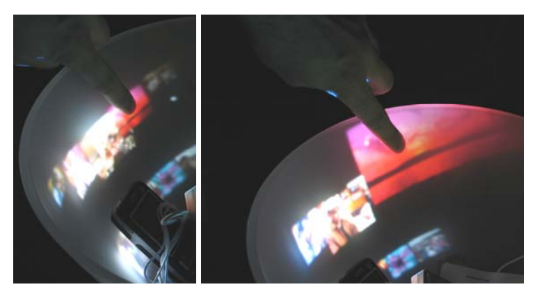
Figure 4. Thumbnail stretching.

For similar reasons, we wanted the bowl to have only limited functionality. The limited features that were chosen to facilitate informal and casual use that would, again, be intelligible. For example, we imagined that image thumbnails might be moved by simply moving the associated device in the bowl or alternatively by simply interacting with the thumbnails directly. Moreover, the projected thumbnails would be 'stretched' as they were moved from the rounded bottom of the bowl to its relatively flat sides (see Fig. 4). This 'stretching' was seen to exaggerate the effect that would be obtained by moving a projected image from a tightly curved to flat surface: a visible and intelligible property of the bowl's physical form.