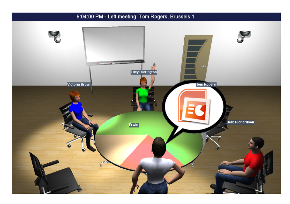
Fig. 1. The VMR application showing participant Erwin as presenting using a speech bubble with powerpoint logo; participant Victoria as speaking using a spotlight; participant Lucy with raised hand.

(e.g., is s/he paying attention). As a form of metadata about the physical world, detailed information of each participant (e.g., name, company, meeting role, etc.) is also shown in the VE.