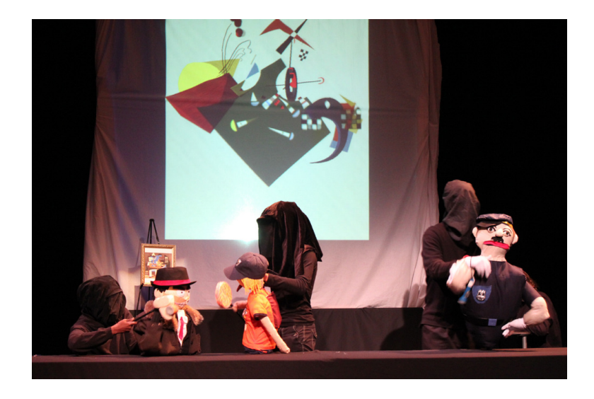
Fig. 5. Performers manipulate the puppets on stage during the XPT performance of Pictures at an Exhibition . The puppets' actions are mapped to the virtual painting in real time.