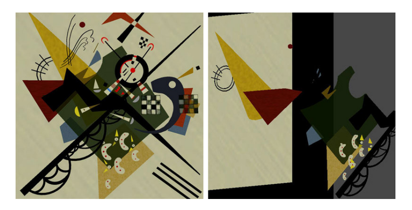
Fig. 4. The virtual artwork -a 3D digital recreation of Kandinsky's On White II . Complete front view (left) and animated portion (right).

orchestrate a smaller version of layered animation as seen in Rybczynski's Tango in real-time. We also included pre-set animations that reflected the intended effects. This allowed us to test the artwork while the puppets were still being built. It also served as back-up in case the connection to the puppets was lost.