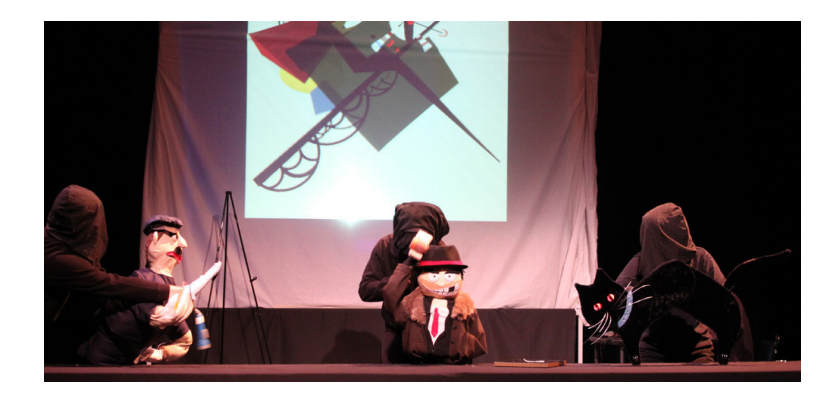
Fig. 1. Performance of Pictures at an Exhibition during the XPT show at the Center for Puppetry Arts.

seven months [14]. Instead of looping the recorded image, our piece captures animation data from puppets during the live performance. This data directly affects the virtual scene but is also looped and layered much like the actions in Tango . However, recording and looping happens in real-time. The virtual space becomes a lasting reflection of the story unfolding in the physical space. The abstract mapping between puppets and virtual scene addresses key questions of digital performance that deal with the relationship of the body to the digital realm in hybrid performance pieces.