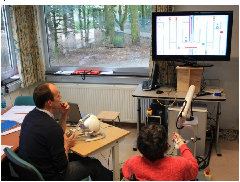
Fig. 1. System setup: with Novint falcon (therapist) and HapticMaster (patient)

The Social Maze, the collaborative training game described in the next section, was designed to combine several skill components. Furthermore, the collaborative nature of the game brings in a social aspect and stimulates interaction between patients and therapists.