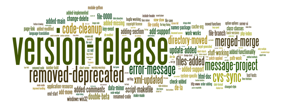
Fig. 5. Topic Tag Cloud: Cliff Walls ("initial-import" excluded)

Overall Topic Proportion and Topic Relative Rank. We discuss these in the next two subsections.