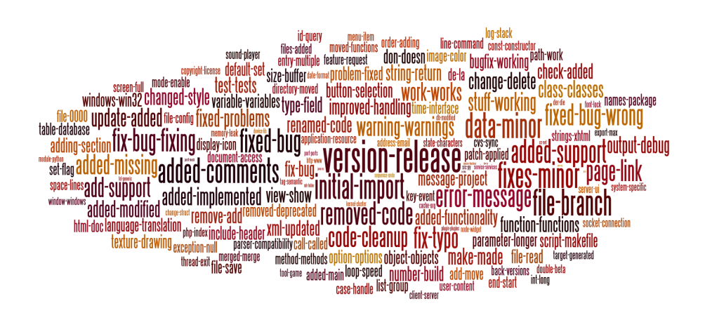
Fig. 3. Topic Tag Cloud: All Commits