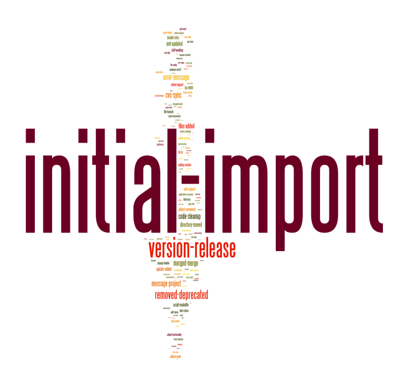
Fig. 4. Topic Tag Cloud: Cliff Walls